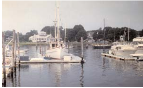
Figure 3. Recreational boaters, commercial fishers, coastal landowners, and coastal visitors are often competing for space in the heavily used waterways of the Northeastern United States. Wickford Harbor in Rhode Island is typical of many coastal waterways with multiple constituency groups who must not be overlooked when planning and operating a shellfish aquaculture operation.

Quantification of the value of aesthetics and other environmental and social non-market values is often a difficult and imprecise task, though estimates can greatly assist decision makers. For example, Johnston et al.