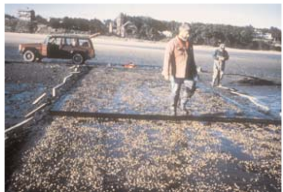
Figure 2. Shellfish farmer Joel Fox in a typical northern quahog, Mercenaria mercenaria , farm plot in Wellfleet, Massachusetts. Extensive sand flats during low tide are cultivated before planting hatchery-reared seed at about 50 clams/sq. ft. To protect against predation, netting is rolled out to cover the entire plot and either fastened to submerged rebar or nailed to boards buried in the sediments. The quahog aquaculture industry in Wellfleet has a long-standing reputation of cordial relations with seaside homeowners.

tecting against predators (Figure 2). Studies of impacts of this type of shellfish farming in England using the Manila clam Tapes philippinarum have shown buildup of fouling organisms on the netting and a concomitant increase in grazing molluscs and juvenile fish associated with the nets (Spencer et al. 1996). While preparation of the beds and harvesting of clams from the plots by various mechanical plows or hydraulic devices disrupts infaunal communities, recovery is rapid with original communities returning in less than a year (Spencer et al. 1998). Disturbance and accidental take of non-target organisms is unavoidable regardless of bed preparation and harvest mechanism; however, in the majority of cases increased diversity and abundance of species living in nooks and crannies of all shellfish compensates for temporary losses (Kaiser et al. 1996).