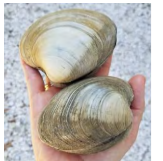
Florida bivalve shellfish farmers!