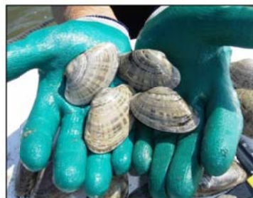
FIGURE 1. Cultured sunray venus