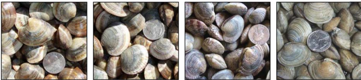
FIGURE 1. From left to right samples after 8-months of growout of Mercenaria mercenaria ( Mm ), hybrid ( \text{♀}Mm \times \text{♂}Mc ), hybrid ( \text{♀}Mc \times \text{♂}Mm ), and M. campechiensis ( Mc ).