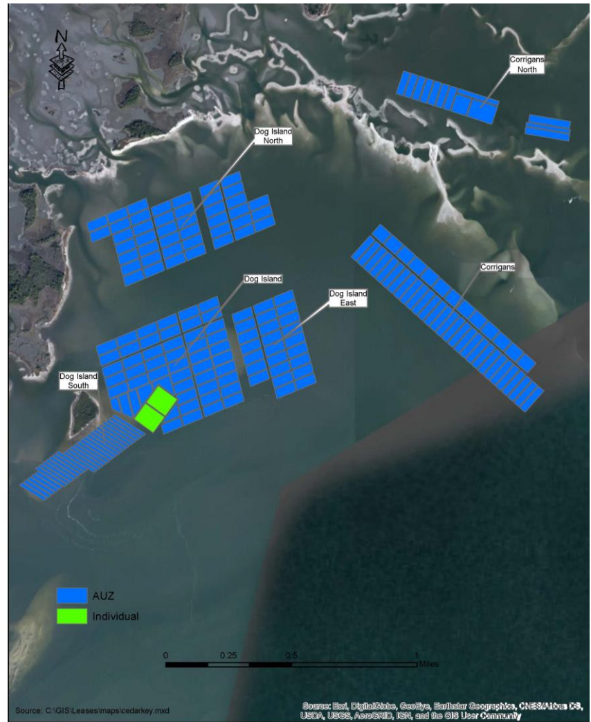
Dog Island and Corrigans AUZs 209 leases (1.5-5 acres)