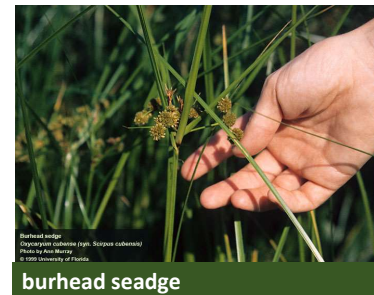
Burhead seadage Cladophora submersa (syn. Scirpus submersa )