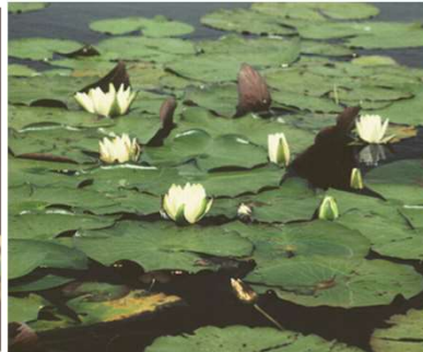
Fragrant water lily