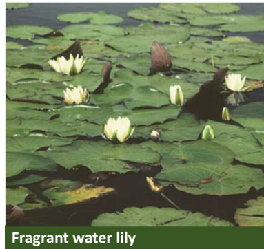
Fragrant water lily