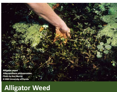
Alligator weed Alternanthera philoxeroides