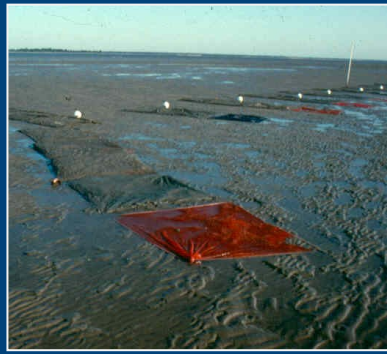
Clams are farmed on bottom leases in nylon mesh bags aligned in rows (Above). Live rock is lowered onto water column lease sites via a wench (Below).