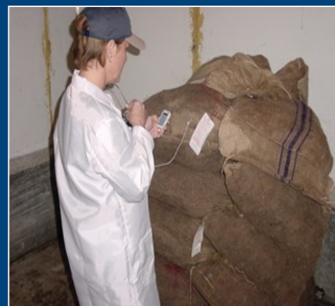
From top to bottom: Shellfish harvesting area classification map; Seagrass bed; Manatees; Staff inspecting shellfish for appropriate temperatures