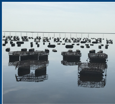
Oyster farms require the full use of the water column for floating or suspended culture gear.