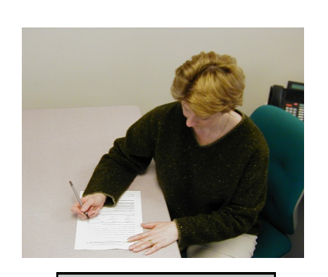
Lease applications can be obtained from the Division of Aquaculture

The applicant describes the proposed aquaculture activity in sufficient detail to allow staff to evaluate the application and determine the suitability of the proposed site for the proposed aquaculture activity. The applicant is also encouraged to provide a scaled drawing of facilities, structures and culture units, and to describe the harvest method that will be used.