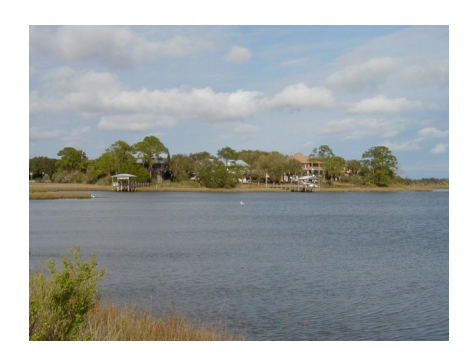
Riparian Property Owners residing within 1,000 feet of lease site must be notified

When the Department is prepared to make a recommendation for approving the lease application and area, staff will provide the applicants with the instructions and materials necessary to notify riparian property owners who reside within 500 feet of the proposed lease site (if any exist), and a Notice to be advertised in a local newspaper. The local government, primarily the affected Board of County Commissioners, will also be notified by the Department. Once this is done, if substantial objections are received, particularly from affected upland property owners, a public hearing may be scheduled in the area.