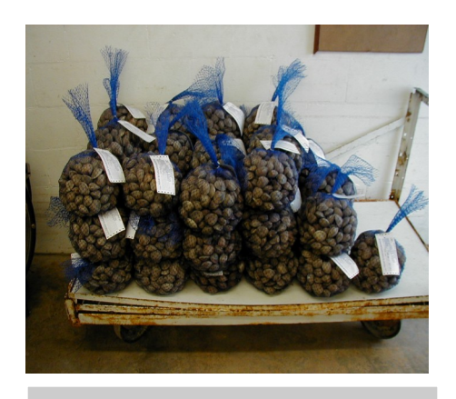
Total value of farmed clams increased fifteen-fold during the 1990s.

Aquacultural production of hard clams, oysters, and live rock is different from many other agricultural activities in that cultivation usually requires the use of sovereign submerged lands. Unlike many upland agricultural ventures that are conducted on privately-held lands, most marine aquaculture must be conducted on or over submerged lands that are largely held in the public domain. Since only a small amount of suitable submerged acreage is privately owned, marine aquafarmers are uniquely dependent upon the use of public lands. Because these lands are part of the Public Trust, resource managers must be diligent in how these lands are used.