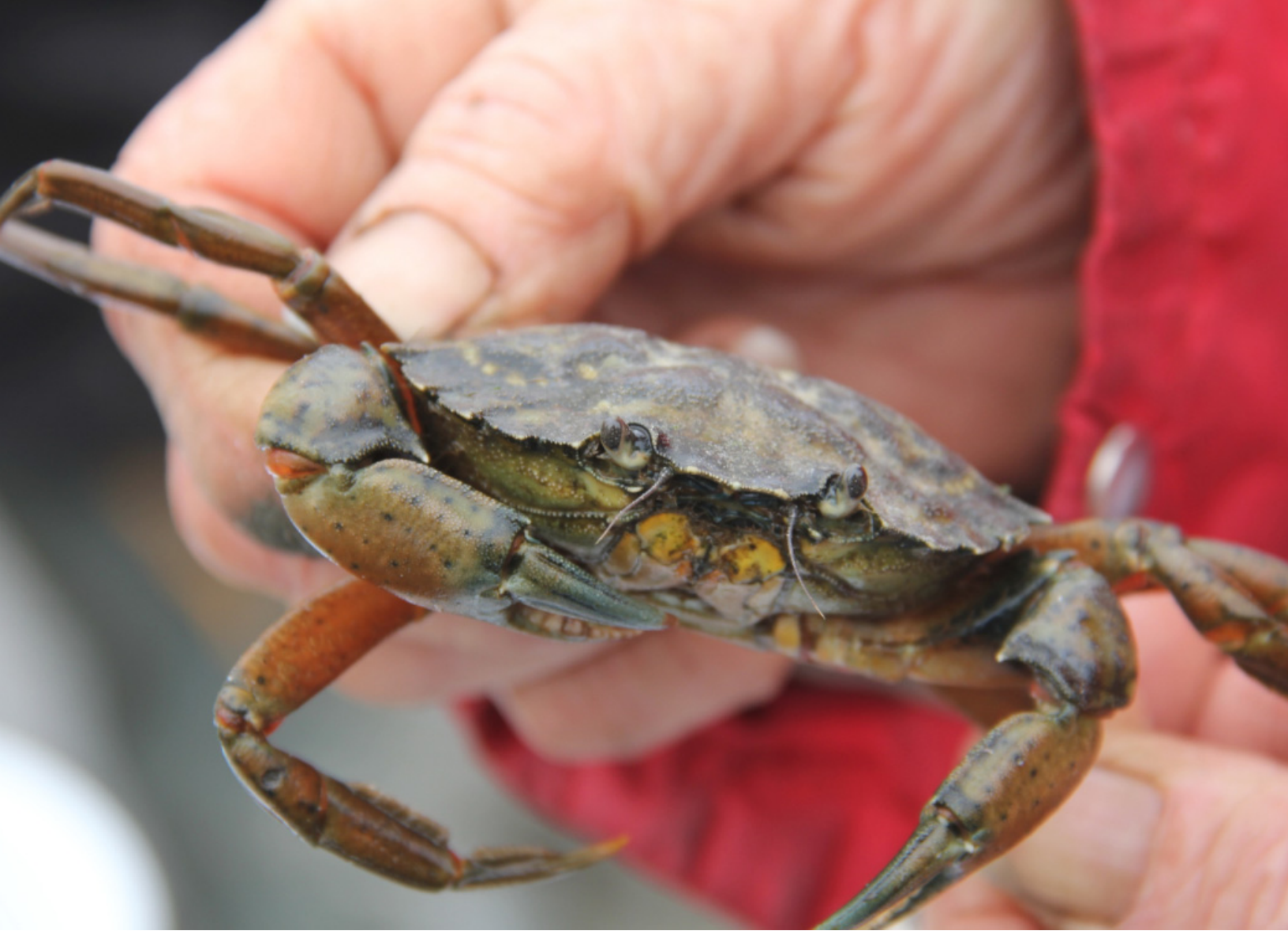
Figure 2. The invasive, European green crab ( Carcinus maenas ). The green crab came to the U.S. accidentally in the ballast of ships in the early 1800s in New York and Boston. Populations are increasing with warming seawater temperatures.