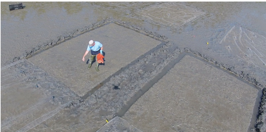
Figure 7d. Seed the plot with hatchery-raised seed clams. Spread them as evenly as possible. Don't walk on the seeded clams.