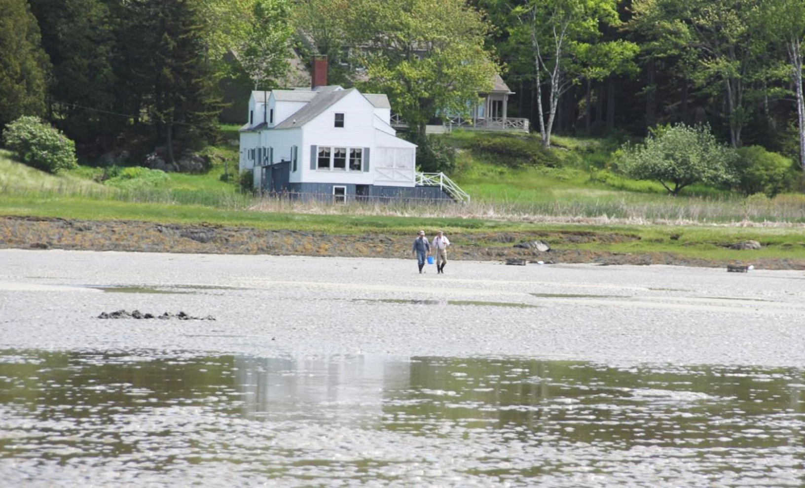
Figure 3. Intertidal flats are legally owned down to the low water mark by the shoreland owner. Gaining shoreland owner permission is critical for clam farming.