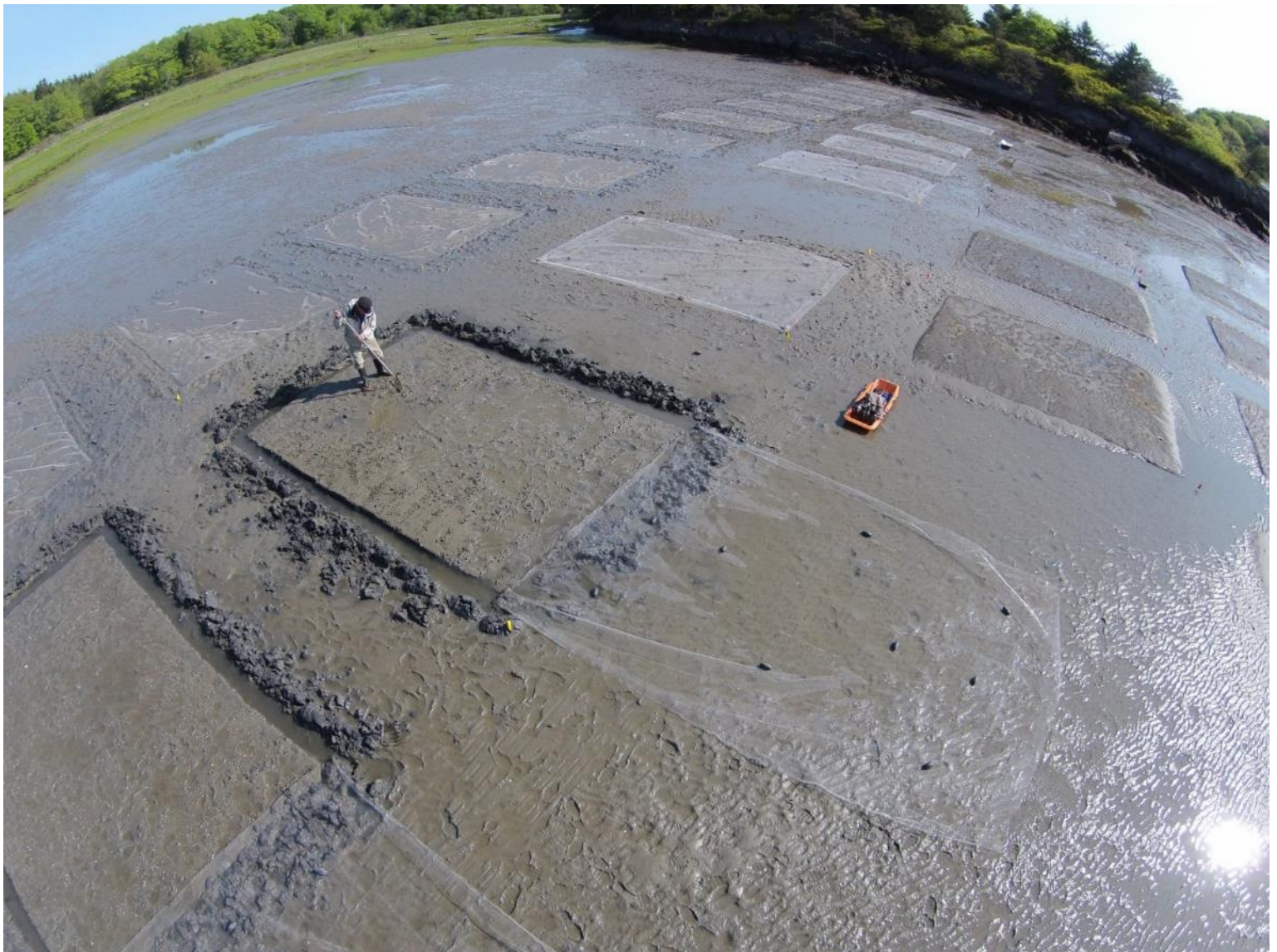
Figure 1. Installation of a commercial-scaled softshell clam farm in Georgetown, Maine. For sites with “hard mud,” the edges of the nets must be buried in trenches, as shown here. In “soft mud,” the edges can be “walked in.”

This guidebook is an introduction to soft-shell clam farming using the seeding-and-netting method. It is a practical, stepwise guide to starting and maintaining a farm. It covers intertidal rights, options for legal protection, tips for building and securing nets, and observations on whether clam farming makes financial sense. As a result of installing Maine’s first commercial-scale soft-shell clam farm in Georgetown, Maine in 2014, and five other farms since then, we have encountered many of the challenges already. This guidebook shares what we have learned.