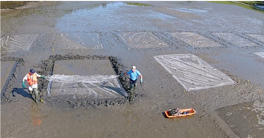
Figure 7c. "Hinge" one short end of the net (fill in the trench on one end) and peel back the net for seeding the plot.