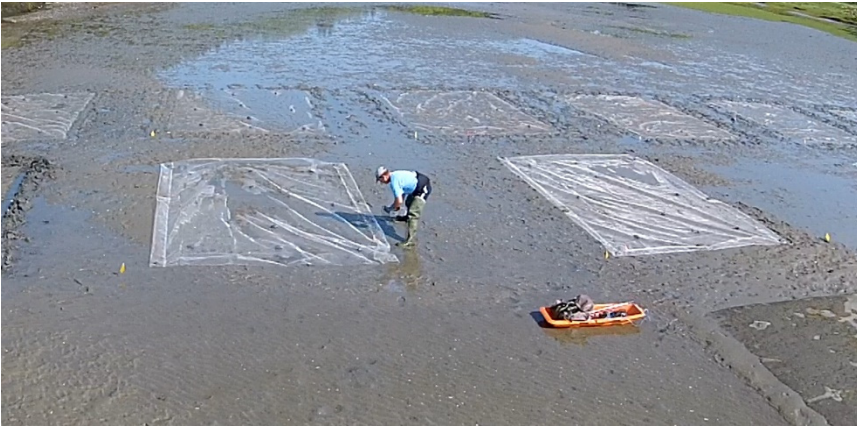
Figure 7a. Once you lay the net where you want it, fold back each of the four edges by about 1 foot.