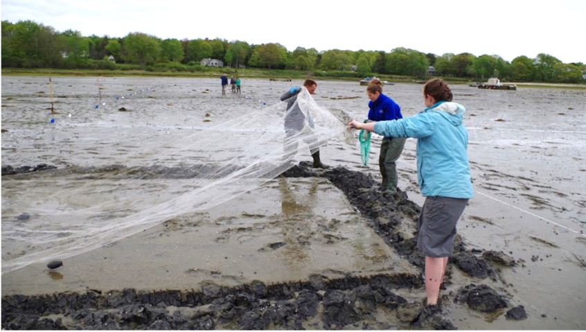
Figure 7e. Cover the seeded plot with the net and fill in all the trenches. The plot is complete.