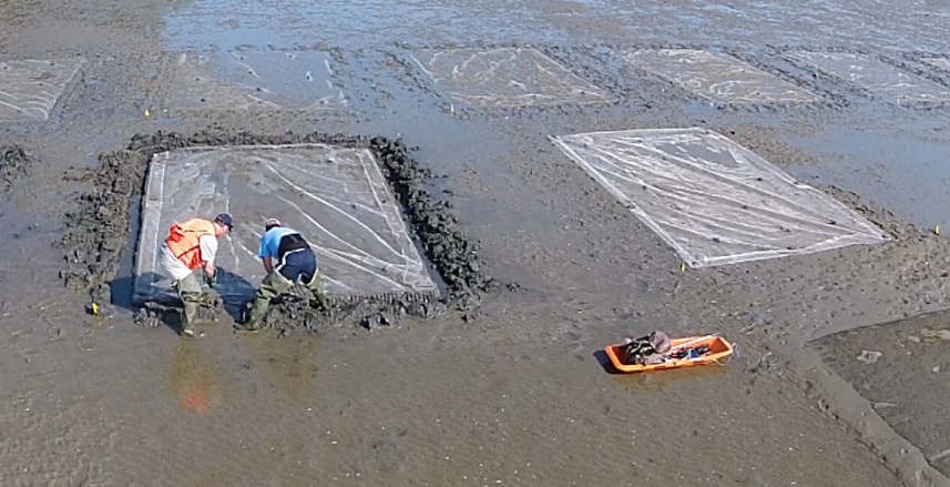
Figure 7b. With the edges folded back, dig a trench about 6-10" deep all around the net. Be careful not to cut the net with your clam hoe.