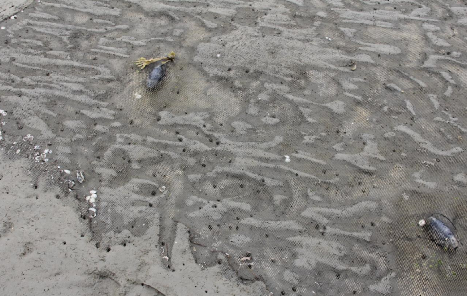
Figure 8. Clam holes showing under a seeded net after 2 years. Note the sediment buildup along the edges of the net. Clams can generally “blow through” a half an inch of sediment, but you do not want sediment to build up on the net over time because the clams will suffocate and starve.

Before removing the net, mark the corners of the net with wooden stakes or 12” galvanized “Texas nails.” You will want to keep the plot carefully marked for future reference, because not all the clams can be harvested in one pass. Plus, you might want to re-seed the exact same net plot in the future.