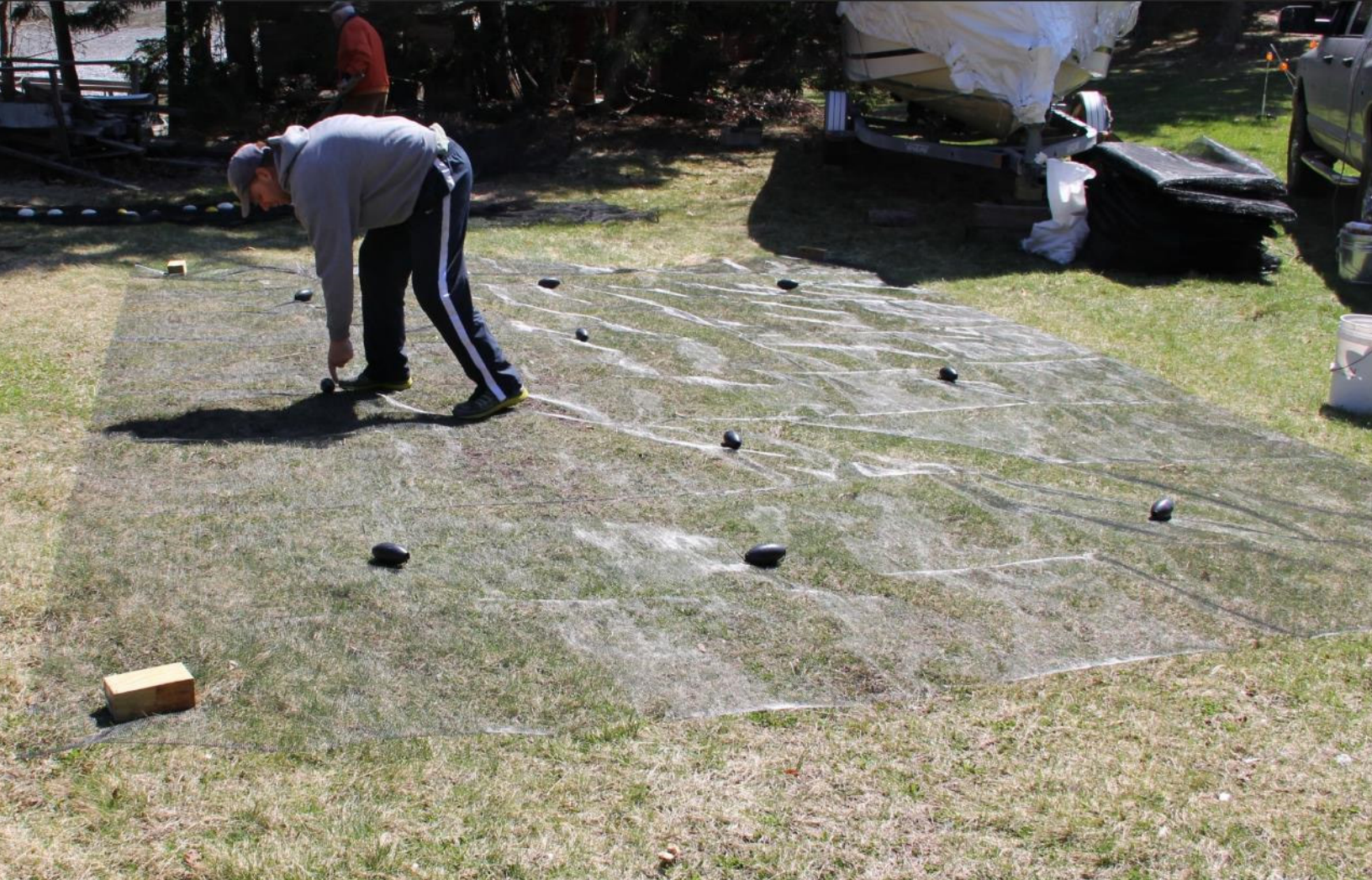
Figure 4. Building a net. Nets are cut in 14 x 20' rectangles (the bulk roll is 14' wide). We attach 10 gill net floats to each net with zip ties (see Figure 5 for spacing). It takes about 5 minutes to build a net. The floats should be on the BOTTOM SIDE of the net when you install the net in the mud.

section) and the survival rate of the seed clams, which is impossible to predict without one or more test trials. The DEI hatchery will, upon request, divide your order into equal bags of seed clams (one bag for each net). This will help ensure that approximately the same number of clams will be placed under each net without having to divide up the seed clams yourself. Not all clams from the hatchery are alive. Inspection of the netted plots 24 hours after seeding will reveal a few dead, empty shells scattered throughout the plot on the sediment surface. This should not be a concern unless the amount of empty shells is substantial.