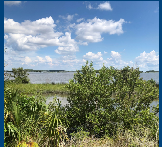
Florida's pristine and highly productive coastal waters provide excellent conditions for shellfish aquaculture.

Environmental stewardship, at its core, requires planning, action and investment to reduce, reuse, recycle and recover the gear and equipment used everyday on or off the farm. An unhealthy aquatic environment cannot support a healthy shellfish crop. Careless farming practices are unsustainable for current and future generations of farmers and processors that depend on shellfish aquaculture products to make a living. While the reader may consider themselves a