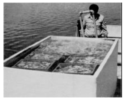
Baskets of shell cultch stacked in a setting tank.

Artificial cultch materials have been examined for suitability in remote setting. For bottom