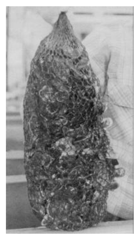
Oyster netting is a common shellbag material.

Important considerations in choosing cultch containers are that they be nontoxic and sturdy and that they allow for good water flow to oyster larvae. The kind of container and its size may influence the type of setting tank you use; most importantly, it will determine your labor and equipment needs in filling, transporting and planting, factors that all affect profitability. A container with cultch weighing 30 pounds will weigh approximately 40 pounds when retrieved from the nursery area; this increased weight is the result of oyster seed, sediments, and fouling. The added weight must be considered in whether you use machinery or hand labor. Handling small containers may