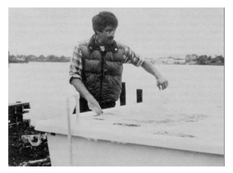
Oyster larvae are distributed by spreading them across the surface of the tank.

settlement occurs during the first day. Metamorphosis of settled larvae to spat takes about another day. Most larval energy reserves have been drained during this process. Thus, allowing the young oysters to recover for a few days in the tank will improve their chances of survival during the stress of being moved to a nursery area.