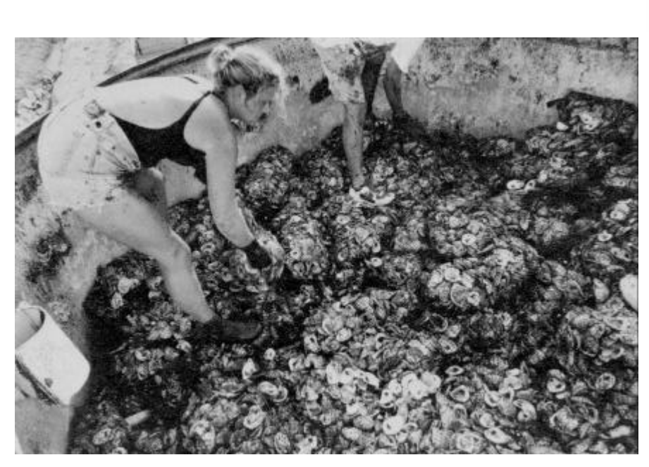
Large fiberglass cylindrical tank for holding cultch containers — in this example, containers are bags of shell.

Many sizes and types of remote setting tanks have been used successfully. Large tanks will minimize the number of settings