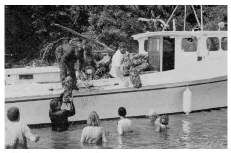
Planting oysters in a protected area.

While stacking protects seed from exposure and improves survival, it increases the need to monitor the nursery. Sediments carried by water may settle out among the cultch,