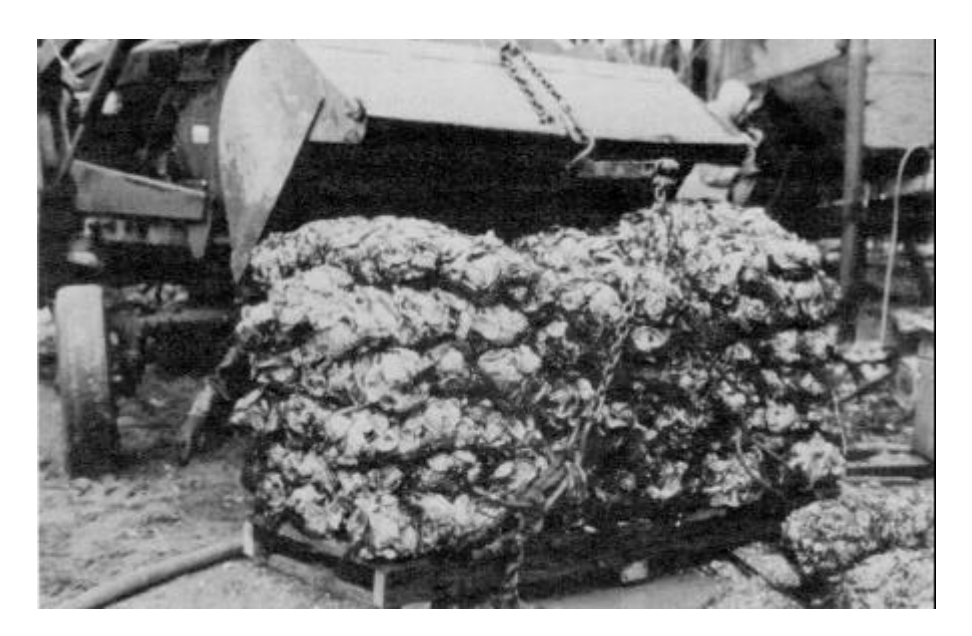
Pallets can provide a foundation for stacking cultch containers on bottom

Clean your setting tank after every use. A few oysters will inevitably settle on the tank itself; if the tank is used often, they may be able to survive and grow. These oysters compete with the smaller oysters for food, and produce waste products in the tank. Consequently, it is important to remove them. Scrub the sides and bottom with a stiff brush. Sponging off the aeration system and rinsing the unit thoroughly is all that is necessary-it is easiest to do this after you've emptied the tank and it is still wet. It is also good practice to allow the tank to dry in the sunlight before being used again. Scrubbing with a diluted bleach solution may prevent persistent growth on the tank, but rinse thoroughly and use bleach only in a well ventilated area.