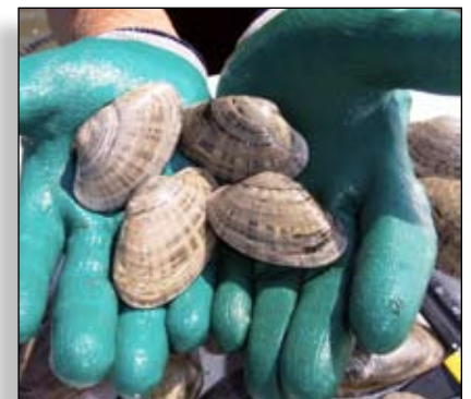
Sunray venus clams harvested after 12 months in the growout culture stage reach about 2" in shell length.