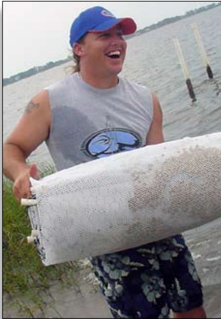
An industry project partner plants sunray venus juveniles for evaluation on a commercial shellfish aquaculture lease.